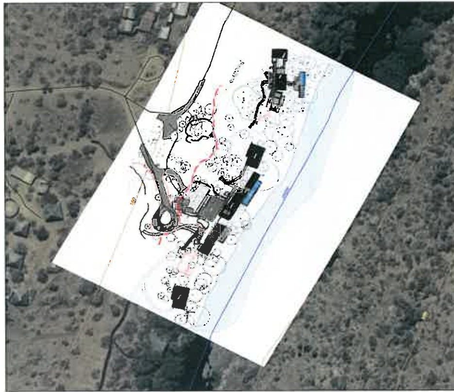
Map 3 Layout Plan

EMROSS Consulting (Pty) Ltd P.O. Box 507 White River 1240 www.emross.co.za