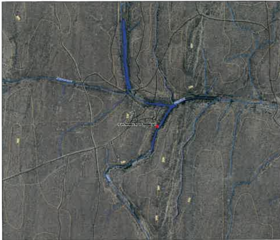
Map 1 Locality Map